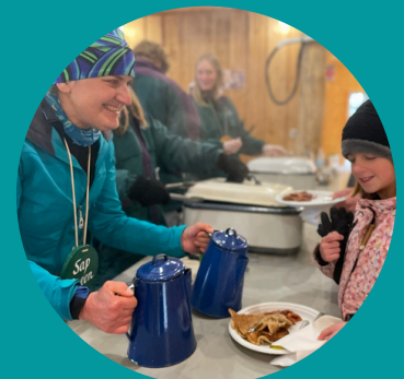
POURING MAPLE SYRUP